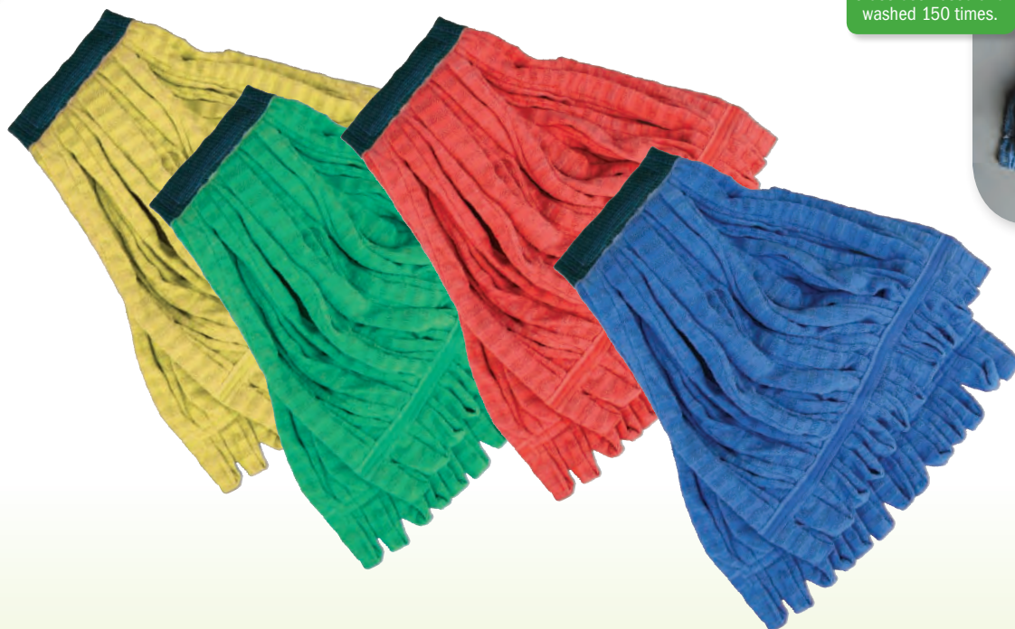
Echofiber mop that's been used and washed 150 times.